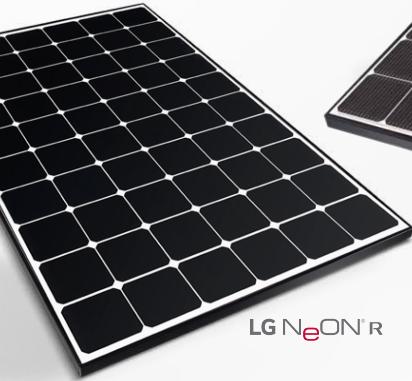
LG NeON ® R