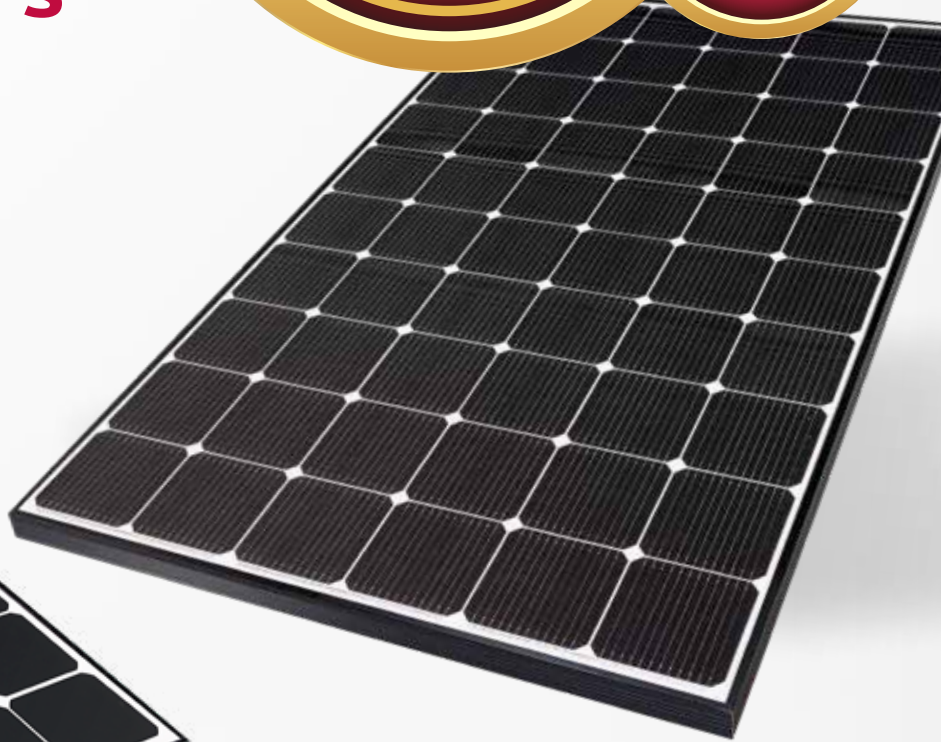
LG NeON ® 2